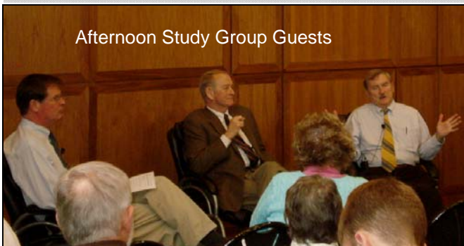
Afternoon Study Group Guests