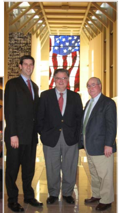
EPSTEIN YEPSEN RATH