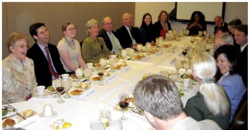
Panelists dine with Governor Sebelius, KU students and other Dole Institute guests.