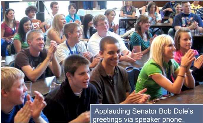
Applauding Senator Bob Dole's greetings via speaker phone.